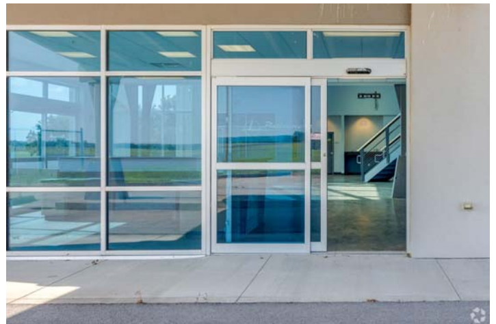
Property Exterior Entrance