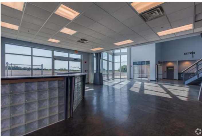
Lobby and reception