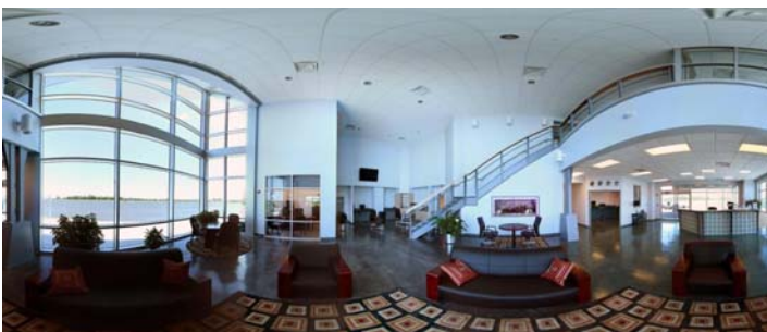
Lobby with furniture