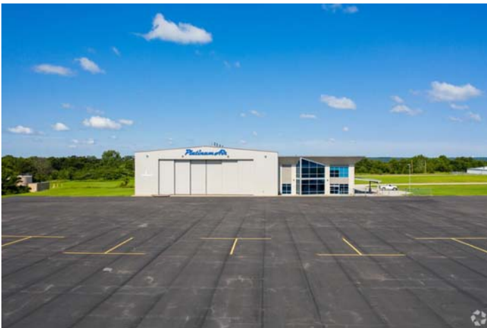
Property with Parking